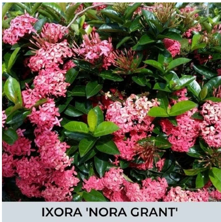
IXORA 'NORA GRANT'